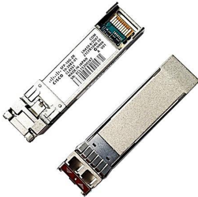
Figure 1. Cisco 10GBASE SFP+ Modules

The Cisco® S-Class 10GBASE SFP+ modules (Figure 1) offer customers a variety of 10 Gigabit Ethernet connectivity options optimized for Enterprise and data center applications. S-Class optics are available for the most common reaches needed for these applications.