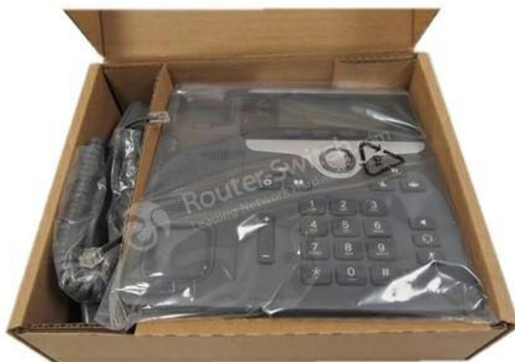
Figure 4 shows the unboxing view of CP-7821-K9.